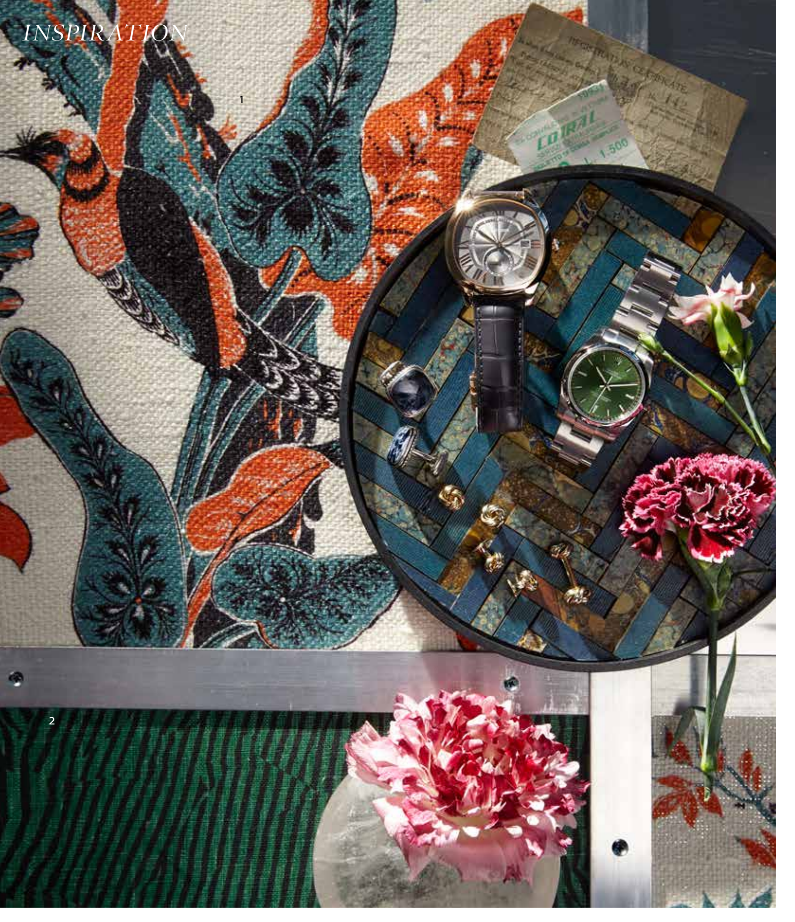
FABRICS: 1. Silkbird printed silk by Dedar. 2. Avant linen by Kelly Wearstler for Groundworks. ACCESSORIES: Round Herringbone tray by Brian Gennett. Drive de Cartier rose-gold watch by Cartier. Oyster Perpetual watch by Rolex. Cuff links and studs by Charvet. Exotic stone-and-pietersite cuff links by David Yurman. For details, see Resources.