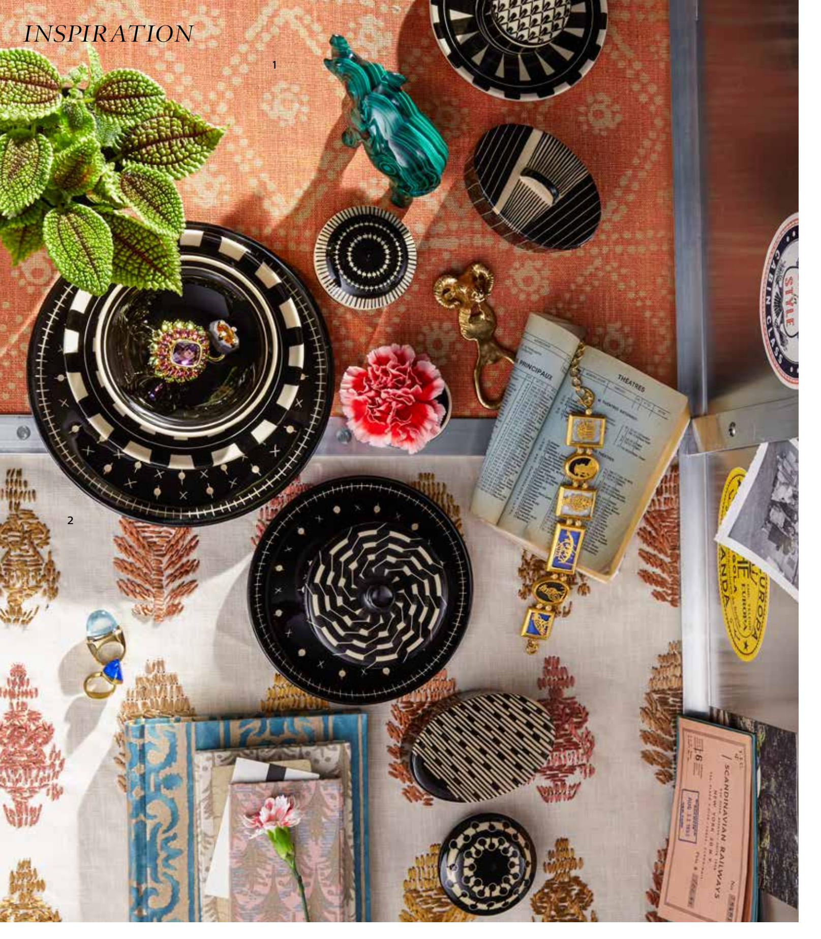
FABRICS: 1. Zig Zag linen by Carolina Irving Textiles. 2. Kos silk-embroidered linen by Vaughan. ACCESSORIES (CLOCKWISE FROM TOP RIGHT): Black-and-cream ceramic boxes and plates by Hedwig Bollhagen for Ritz Marwitz. Malachite elephant and brass ram bottle opener from Creel and Gow. Antiquity gold-and-diamond bracelet by Coomi. Fabric-covered notebooks by Fortuny. Pyramid lapis-and-yellow gold ring by Katherine Jetter. Vintage aquamarine-and-gold ring by Paloma Picasso for Tiffany & Co. from Mahnaz Collection. Chatelaine amethyst, rhodolite garnet, and peridot ring by David Yurman. Duo ebony, citrine, diamond, and yellow gold ring by Nicholas Varney. For details, see Resources.